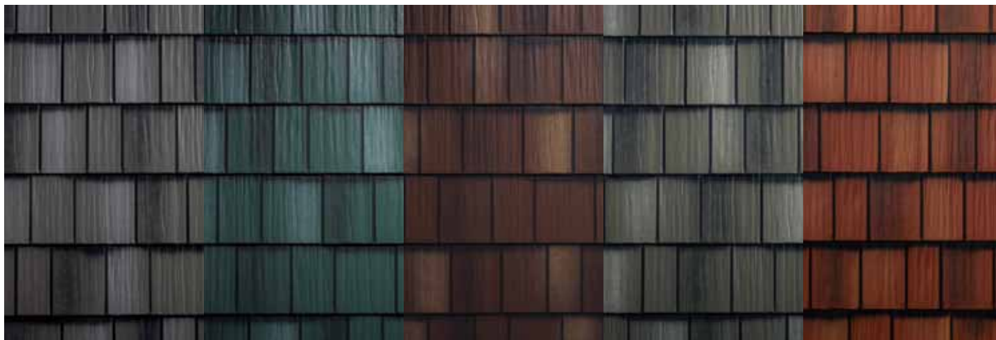
Charcoal Gray Blend*