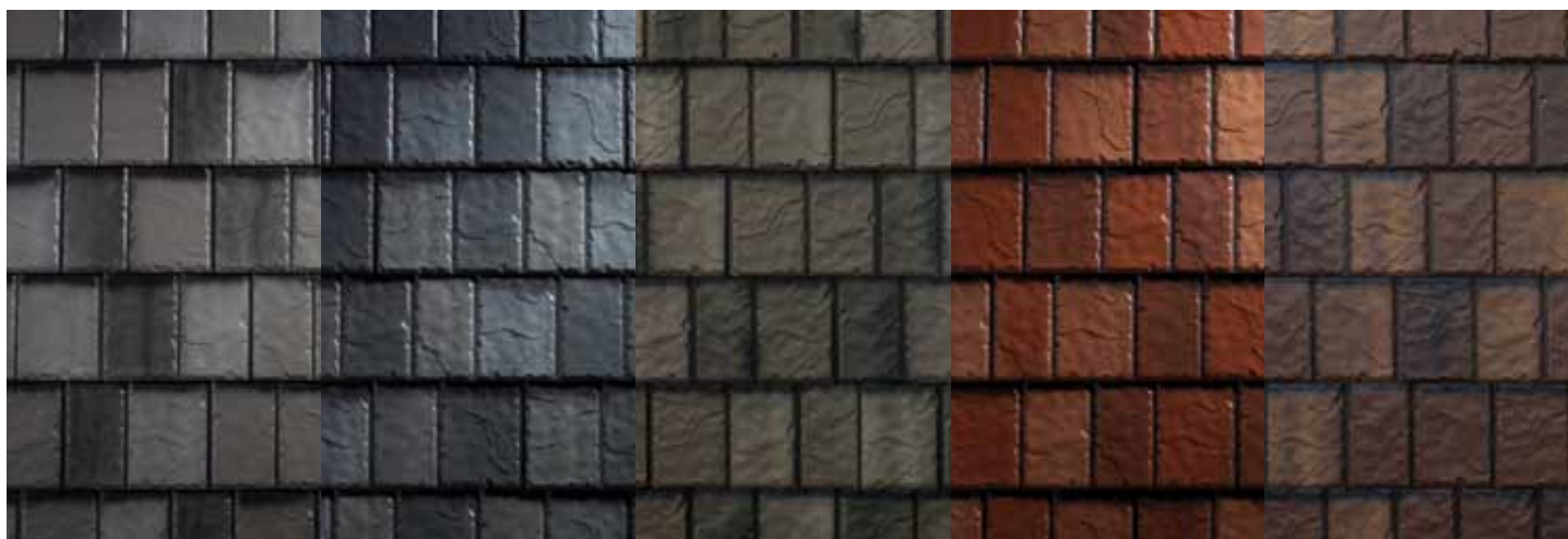
Charcoal Gray Blend*