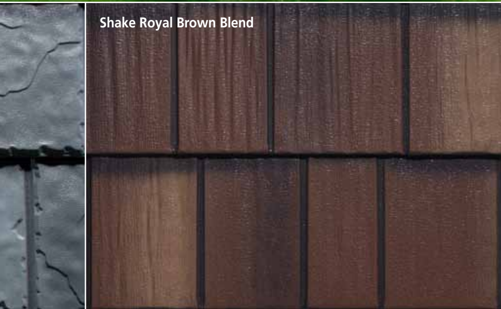
Shake Royal Brown Blend